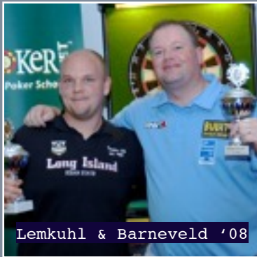
Lemkuhl & Barneveld '08