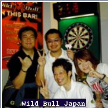
Wild Bull Japan